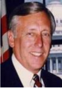
Congressman Steny H. Hoyer. (D-MD) of Maryland's Fifth Congressional District